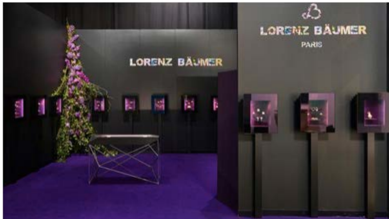
The Lorenz Baumer jewellery stand.

The exhibition, as with last year, is held close to Geneva airport at the Palexpo centre. After the art show is over, visitors to the fair can round off their trip with a visit to one of Switzerland's alpine ski resorts before the winter season comes to a close.