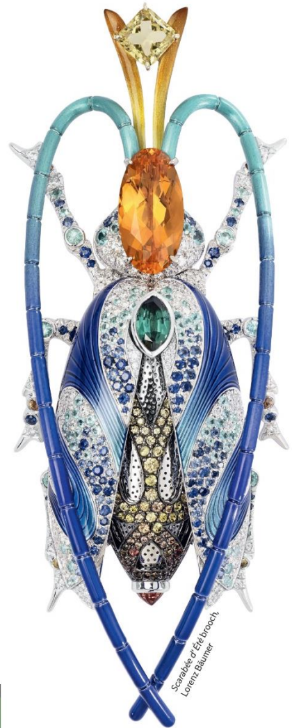
Scarabée de l'Éléphant Lorenz Bäumer

EXPLORE Building on the success of the inaugural London Design Biennale in 2016, up to 40 countries (including the UAE and KSA), cities and territories will exhibit at Somerset House this September in response to the theme 'emotional states'. The diverse entries will explore how design affects every aspect of our lives and influences our emotions. Look out for the indoor rainbow at the Australian pavilion. 4-23 September 2018. londondesignbiennale.com