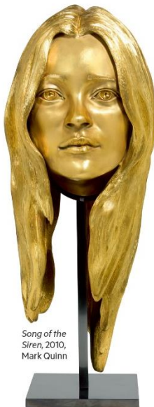
Song of the Siren , 2010, Mark Quinn