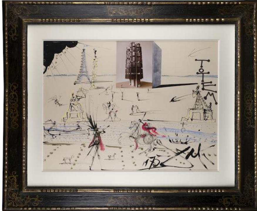
Salvador Dalí Totem. Medidas con marco

The stand was painted a deep blue which perfectly enhanced the color of the furniture, highlighted with tasteful lighting.