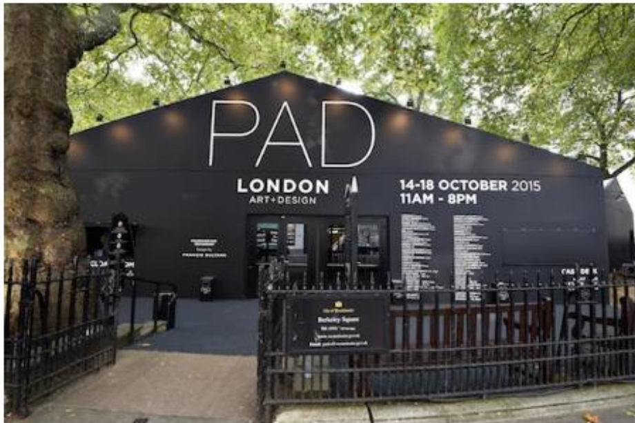
PAD is situated in Berkeley Square in Mayfair

PAD London Art + Design opened for VIPs on Wednesday, with the usually high standard of fine art, furniture, and design. The plush venue, a luxury tent in Berkeley Square that incorporates the beautiful trees in the park as part of the stands, seeks to inspire visitors to collect with the eclectic range of luxury items on sale.