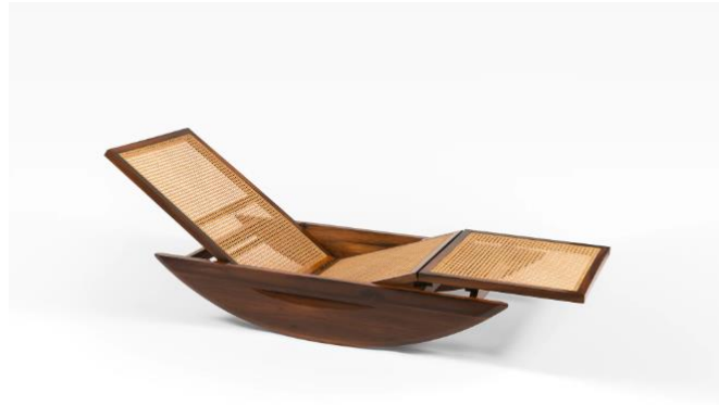
Jacaranda and cane deckchair by Joaquim Tenreiro, c.1947, from Galerie Chastel-Maréchal