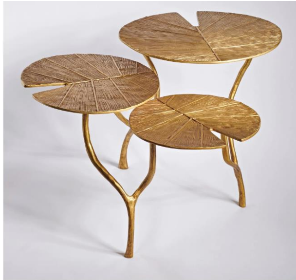
Three-leaf Lotus coffee table by Franck Evennou, polished bronze, signed limited edition of 23, from Avant-Scène