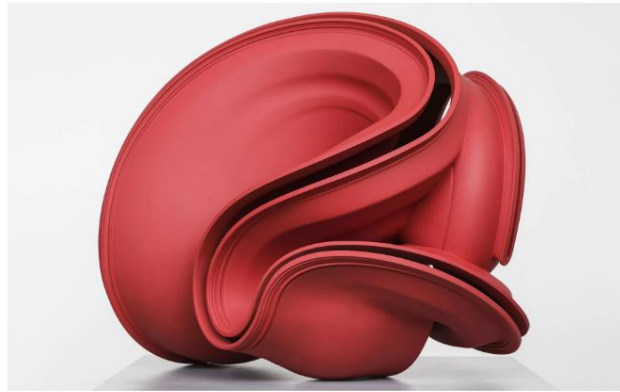
Red Square by Tony Cragg, 2007, painted bronze, from 18 Davies Street