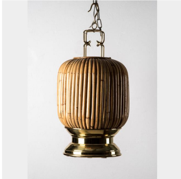
Lantern by Gabriella Crespi, Italy, 1970s, from Nilufar