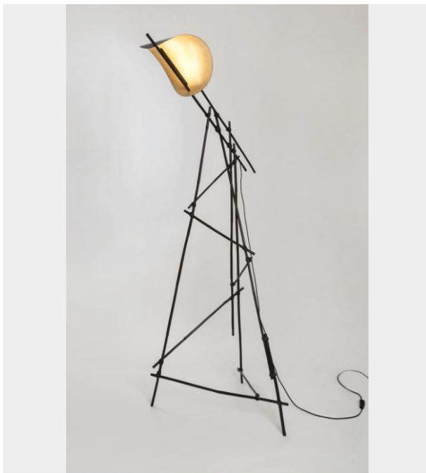
Bronze En Passant floor lamp by Glithero, 2018, from Gallery FUMI