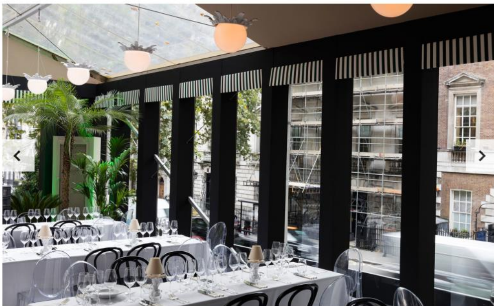
The striped pattern on the floor is echoed by the restaurant's table setting, with an alternation of Philippe Starck's 'Louis Ghost Chair' for Kartell and classic Thonet '214' chairs in a bistrot-like setting

For six days only, the dramatic venue will offer a bright accompaniment to the cavernous downstairs – both as an escape from the fair's bustle and as a charming space in itself.