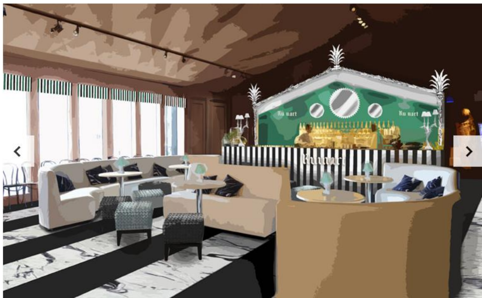
On the bar side, the room takes on a more eclectic look, with a bright emerald green wall framed by exotic plants and palm trees, and a lounge area reminiscent of Sultana's elegant interiors