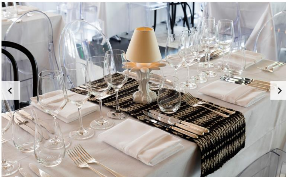
On the tables, the black and white theme is continued