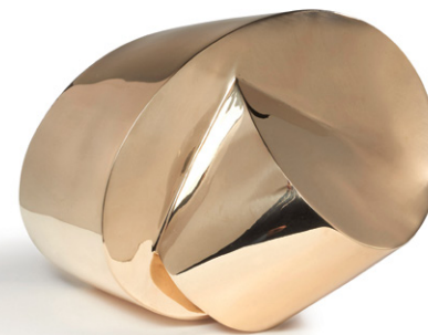
ABOVE: Fruit Etrange II , bronze sculpture by artists Perrin & Perrin. Courtesy of Galerie Negropontes, Paris, France.